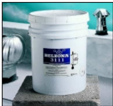
AVAILABLE IN 15 LITERS (4 GALLON) UNIT SIZE