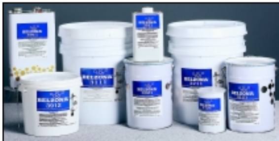
BELZONA® 3000 SERIES POLYMERIC MEMBRANES